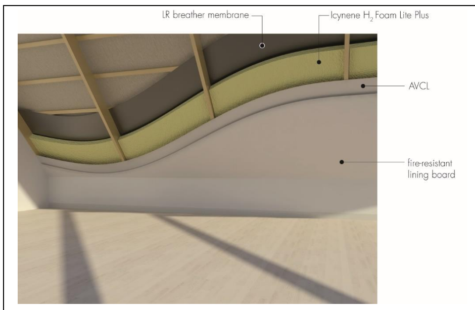
Figure 1 Pitched roof construction: habitable room in the roof

15.12 In cases of non-habitable roof constructions, a VCL/AVCL is placed (when necessary) at horizontal ceiling level. The ceiling should be well-sealed.