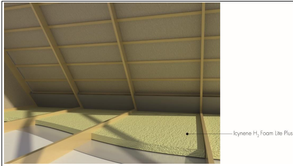
Figure 2 Pitched roof construction: non-habitable loft space